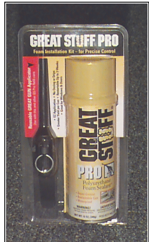
Figure 1. Polyurethane foam sealant

This past summer a study was conducted on a broiler farm to demonstrate how house tightness affects air temperatures during hot weather in houses with evaporative cooling pads. The study was conducted on a farm with two, very loose 40' X 400' broiler houses. The amount of leakage was estimated by conducting a static pressure test. The side wall and tunnel inlets were closed, then one 48" fan was turned on and the static pressure was measured. The static pressure created by the one 48" fan was found to be approximately 0.03" in both houses, indicating that there was well over 20 square feet of leakage in each house (see Poultry Housing Tips: Reducing Broiler House Heating Costs , January 1997). The houses were then examined and the primary sources of the leakage were determined