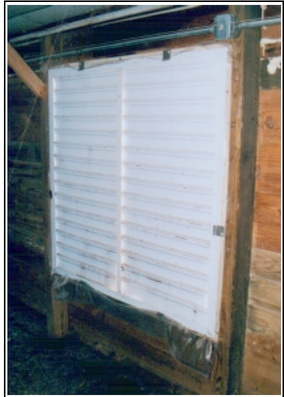
Figure 3. Plastic sheeting over fan shutter

If your broiler houses are extremely loose, consider contacting a professional spray foam insulating contractor. The cost of having the top of the side walls and the roof ridge sealed was estimated at approximately $1,500 for the 400' house used in our study.