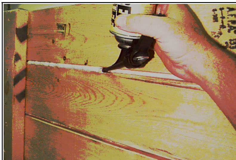
Figure 2. Can of spray foam with special applicator head

Admittedly, this farm was a fairly extreme example, but it reinforces the fact that one of the keys to improving efficiency for many poultry producers is to make their houses tighter. Poultry producers with minor house tightness deficiencies probably do not need a commercial outfit come out and spray foam their houses. In many cases all that is required is a dozen or so cans of spray foam insulation and some plastic sheeting or curtain material. For instance, on a second farm in the same area a grower had four houses which to begin with were significantly tighter than those mentioned above but still had room for improvement. With one 48" fan the producer could obtain a static pressure of 0.08" which was not quite high enough to get the inlet machine, which was set at 0.05" (low limit) to 0.10" (high limit), to open the side wall inlets.