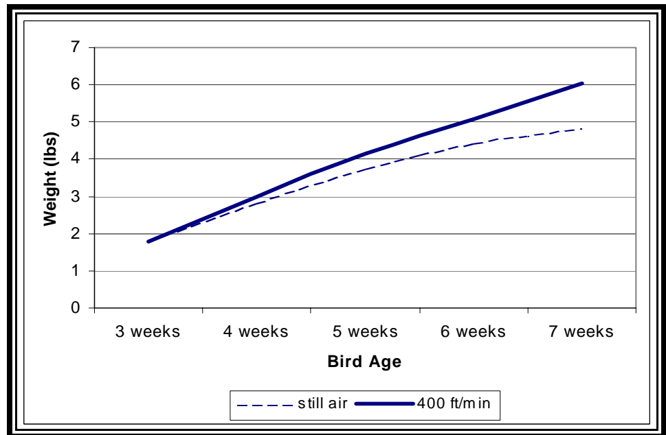
Figure 1. The Effect of Air Movement on Bird Weights

It is common knowledge that the older a bird gets the more problems hot weather can cause. There are a number of reasons for this. First, older birds produce significantly more heat than younger birds. For instance, 24,000 one-pound broilers will produce the same amount of heat as that produced by four conventional brooders operating constantly. But, 24,000 seven pound broilers produce the same amount of heat as 30 conventional brooders. More heat, more problems. Next, older birds are better feathered and therefore better insulated than smaller birds making it more difficult for the birds to rid themselves of the heat they