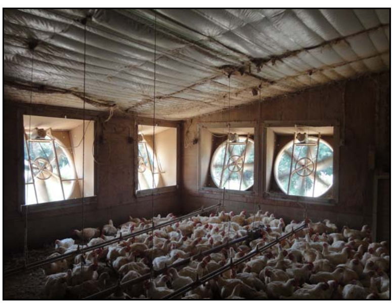
Figure 1. Adjacent tunnel fans operating in the corner of a tunnelventilated broiler house.

How Does Tunnel Fans Placement Affect Fan Performance and Air Distribution? - Part 3 Volume 24 Number 3 March, 2012