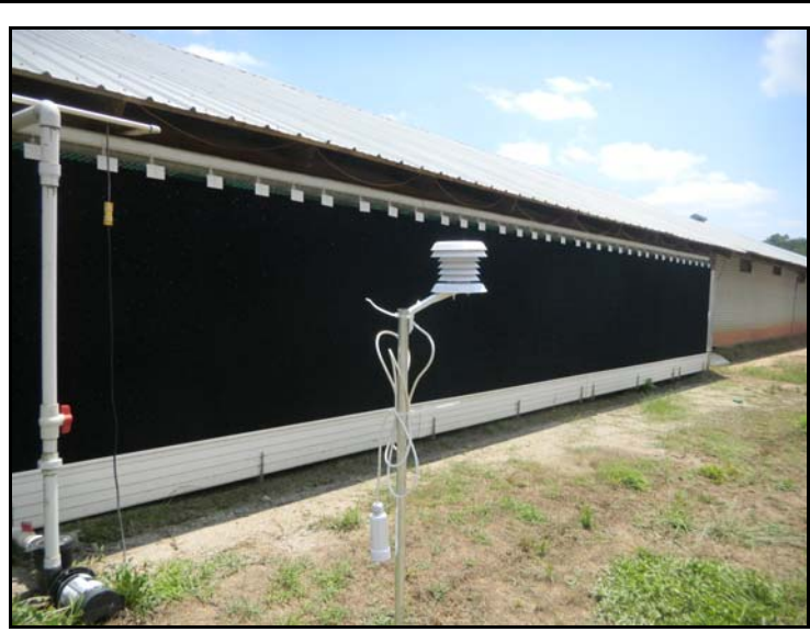
Figure 1. Example of solar radiation shield.

Having an accurate outside temperature sensor wired into a house's environmental controller can be helpful in managing the environment within a poultry house. During cold weather some controllers are able to adjust minimum ventilation rates based on outside temperature. This can be helpful because as outside temperatures decrease, the air tends to contain less moisture so minimum ventilation rates can be slightly decreased, resulting in reduced fuel usage. Side wall inlet static pressure settings can also be tweaked based on outside temperature. The colder it is outside, the heavier the air will be, which means it is best to slightly increase air inlet static pressure settings as outside temperatures drop. A higher level of static pressure increases the speed at which the air enters the house, which will tend to keep the colder air moving along the ceiling longer, increasing the likelihood the air will warm and dry before moving down to floor level.