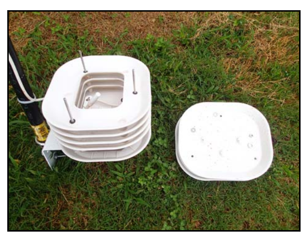
Figure 3. Partially assembled solar radiation shield with temperature sensor (upside down).

The best way to obtain an accurate outside temperature measurement is to use a solar radiation shield and place the sensor at least 15' from the poultry house. A solar radiation shield is designed to protect a temperature sensor from direct sunlight while at the same time promoting good air flow over the sensor. The typical solar radiation shield consists of a series of stacked reflective plates with space in the center for the temperature sensor (Figures 2 and 3) and a mounting bracket so it can be attached to a pole or post. Solar radiation shields cost between $40 and $80 and are available from poultry house controller manufacturers as well as companies that sell weather stations.