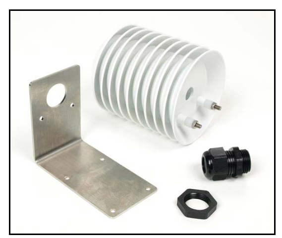
Figure 2. Choretime solar radiation shield.

The much too common problem on many farms is that the outside temperature sensors that producers are using to make potentially important management decisions are not accurate. The two most common causes of inaccurate outside temperature readings is that outside temperature sensors are commonly mounted on the house itself or at most a few feet from the house and the sensor is exposed to direct or indirect sunlight. In order to obtain an accurate outside temperature reading an outside sensor should be placed at least 15' from a poultry house. One of the most common locations for an outside temperature sensor is just outside the control room under the roof eave. The problem with this location is the sun will heat the roof and side walls of the house, which will tend to heat the air in the immediate vicinity making it appear that it is hotter outside than it really is. This will tend to happen not only in the summer but the winter as well. But if an outside temperature sensor is not placed under the eave, the likelihood of direct sunlight striking the sensor increases. When direct sunlight strikes a sensor it will tend to heat the sensor to between 5 and 40 degrees above the ambient air temperature, resulting leading a producer to believe the outside air temperature is much higher than it really is.