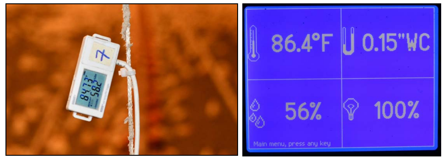
Figure 1. Temperature/Rh data logger

The question is why we continue to use tables to determine our minimum ventilation rates when digital humidity sensors are readily available to help poultry producers accurately determine if they are ventilating enough during cold weather. After all, we don't use a heater runtime table to determine how much we need to run our heaters. We measure the temperature, through our controllers, and our heaters operate accordingly. We need to start thinking about air quality control the same way. The best measure of air quality is humidity. We should continuously monitor house humidity then make the necessary adjustments to our minimum ventilation fans run time to maintain the desired level of humidity. If the humidity is too high, minimum ventilation fan runtime is increased. If it's too low, runtime should be decreased. It is really that simple.